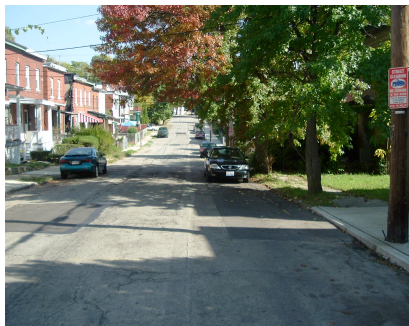
Project Site Looking East

The feasibility study identified several options that illustrate the ideal number of residential units suitable for each identified property, optimum number and size of bedrooms, and the suitability or otherwise of each property to accommodate Uniform Federal Accessibility Standards, UFAS-designated units. The HACP prefers to develop properties to accommodate three and four-bedroom UFAS-designated units.