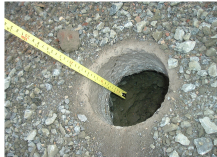
Landing Zone Pavement Cross-Section

This project involved an assessment and evaluation of the subsurface conditions relating to the foundation investigation for a proposed landing zone to conduct aircrew training for Northeast C-17 and C-130 units, of the Air Mobility Warfare Center, and the USAF Weapons Instructor Course Flight Operations. The investigation provided the data necessary to support and develop a Requirements Documents for the construction of the landing zone.