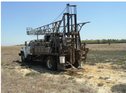
Drill Rig on Project Site

The assessment and evaluation was based on a two-phase geotechnical subsurface engineering investigation conducted by Multi-Lynx on the project site. Following the assessment, Multi-Lynx defined the subsurface conditions at the project site, and, based on those conditions, derived conclusions and recommendations regarding possible impacts on the proposed construction of the landing zone.