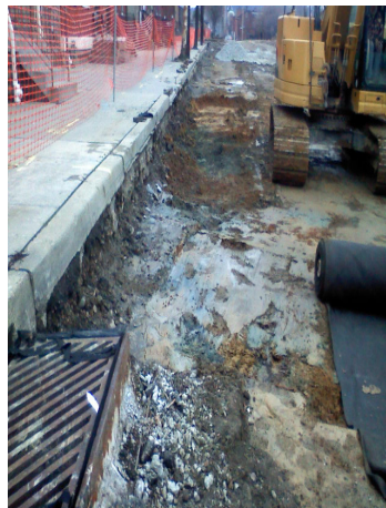
Overexcavation of Unsuitable Material