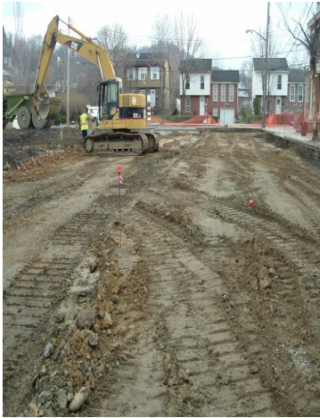
Test Pit Investigation

Multi-Lynx personnel are experienced in all facets of embankment and slope stability analyses, soil-structure interaction, and soil mechanics.