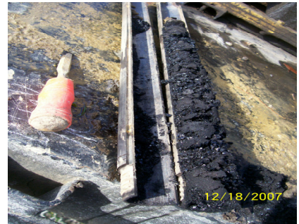
Recovered Subsurface Material

The objective of the investigation was to provide the data necessary to support site preparation, and design and construction of residential housing and support facilities. The existing development consisted of a bench with a surface elevation of approximately 1174 feet above mean sea level, and a second lower bench to the South at an approximate elevation of between 1040 and 1100 feet above mean sea level. Coal was believed to have been mined in the vicinity of the proposed development.