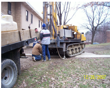
Drill Rig on Project Site

After conducting field investigations and laboratory analyses of representative field soil and fill samples, Multi-Lynx developed and issued specific geotechnical engineering recommendations for site preparation, building foundation, pavement design, site grading, and construction management.